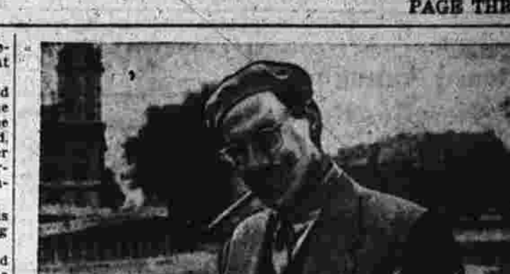
Fishing Drives Groucho In Seine The poor fish looking for a few new lines in the river Seine is that well known angle-catcher, Groucho Marx. "Don't flounder around," he says. "Cast your eyes at the new De Soto for '55. You'll be really glad you did." Coming to you from De Soto dealer's November 17. Go see it!